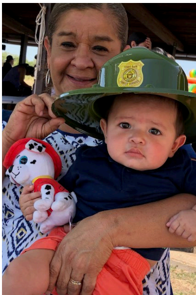
Smokey, Sparky and Granny . What could be more fun for a young park visitor??

park staff aided by FoSASP volunteers. Popcorn and drinks were provided by SASP, snacks by Johnsons Funeral Home and Lawnhaven Memorial Gardens, ice cream from Blue Bell and cake from Texas Forest Service. Young and old alike enjoyed games, and displays of some of the park's wildlife.