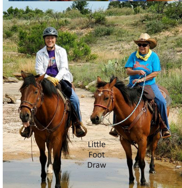
Little Foot Draw