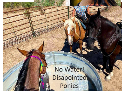
No Water! Disappointed Ponies