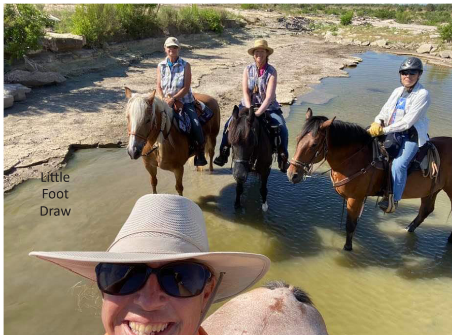
Little Foot Draw