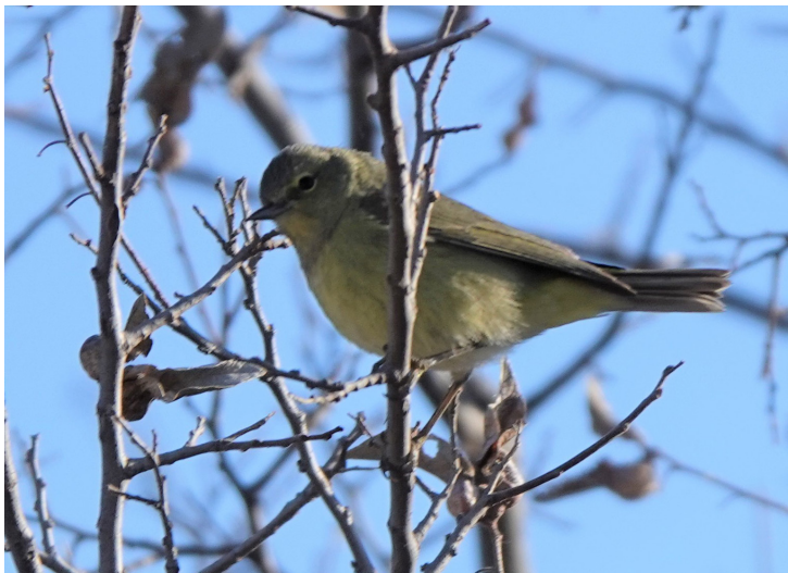
Various Warblers are in the midst of migration. This one is an Orange Crowned Warbler. Keep an eye out for more.

He has been a valuable volunteer, recently assisting Laurel Scott to correct a hazard at the bird blind, javelina had dug a hole under the gate, creating a dangerous walk for the volunteers who enter to feed the birds.