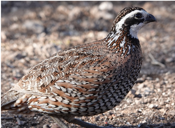
LEFT: A small covey of Northern Bobwhite Quail have been making an appearance in the bird blind.

Note: FoSASP grants financial support to any Boy Scout accomplishing his Eagle Project in the park.