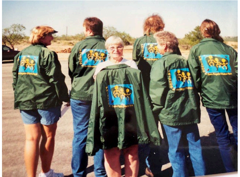
A LOOK BACK